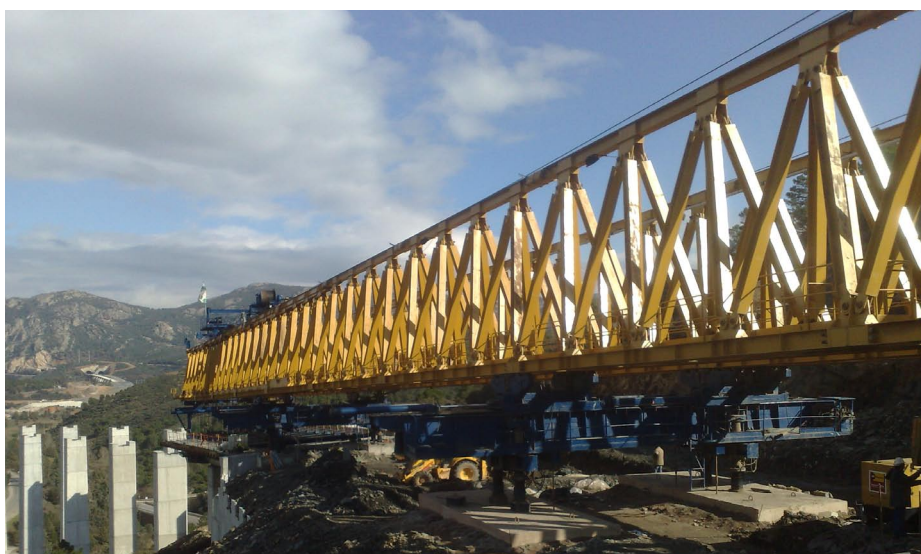
Construction work at one of the viaducts

between 156 and 580 metres and five tunnels dug from the inside out, from 197 to 1,850 metres in length.