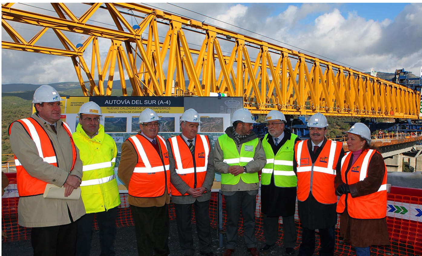
Secretaries of State Víctor Morlán and Gaspar Zarrías during the tour of the site

The total investment is more than 226 million euro