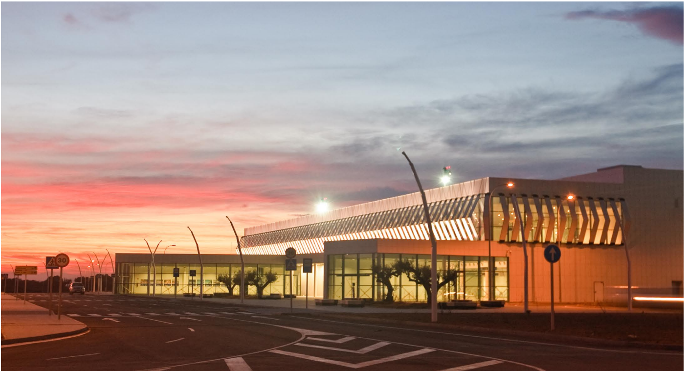
The passenger terminal

The visit took place on 11 February 2010