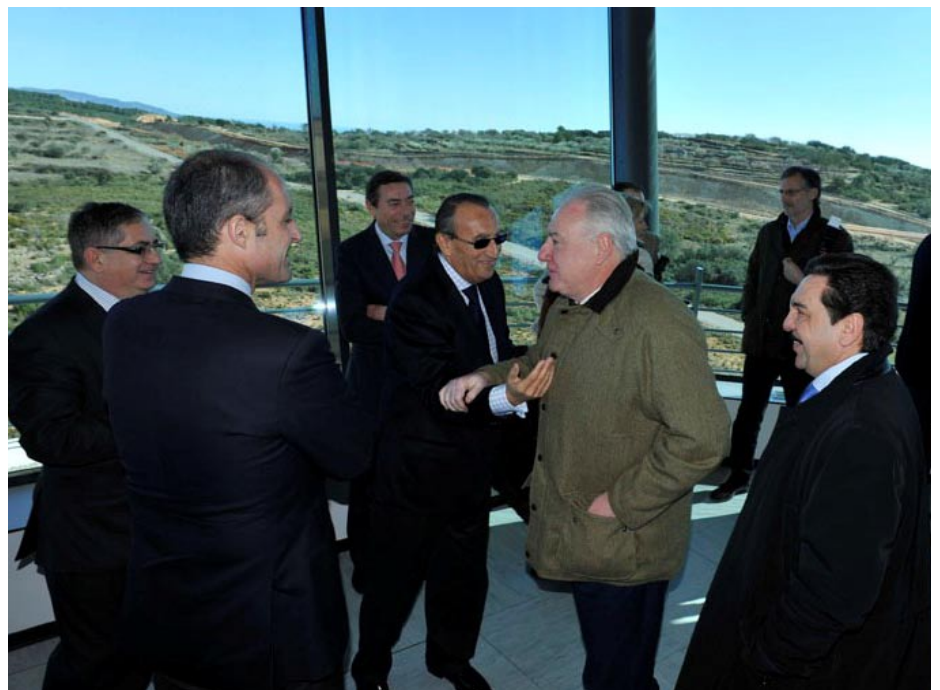
Valencian President Francisco Camps during his tour of Castellón Airport

The 68,000-m 2 parking apron can accommodate eight type-D aircrafts, while the passenger terminal, which is a two-storey, 9,000-m 2 building, has twelve check-in desks, four boarding gates and two baggage carousels.