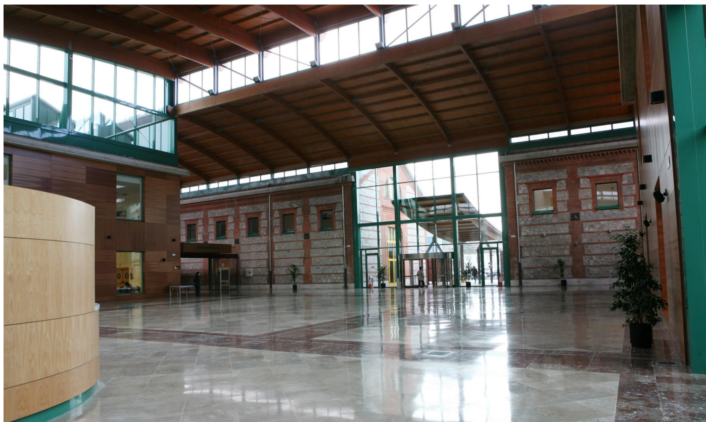
The central space

Both facilities are located in a former tobacco warehouse