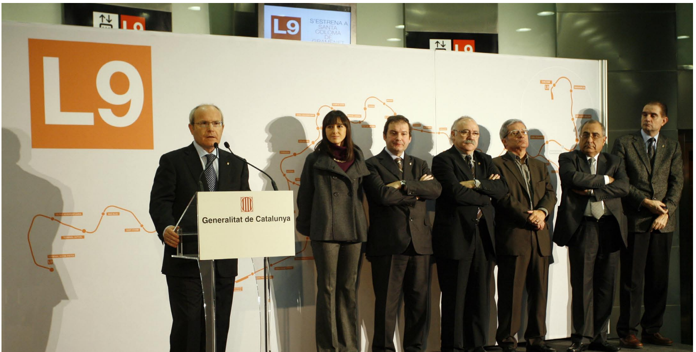
Catalonia President José Montilla at the opening ceremony

The first 3.9-kilometre-long section is commissioned