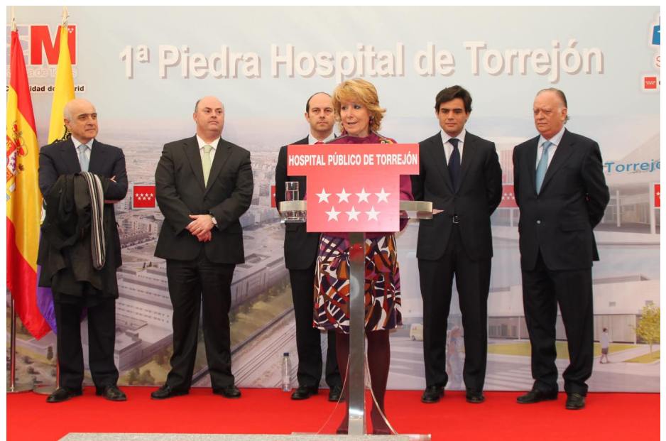
Madrid President Esperanza Aguirre at the cornerstone-laying ceremony

million euro. The centre incorporates criteria of sustainability, which means it uses renewable energy and bioclimatic architecture. It will also have electronic clinical records and digital radiography.