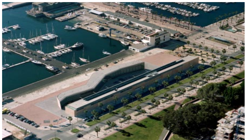
Aerial view of the museum

underwater pieces of the Spanish subaquatic cultural heritage. It is outfitted with the latest interactive video and display technology to enable visitors to get a real feeling for the museum's absorbing contents and the environment they come from.