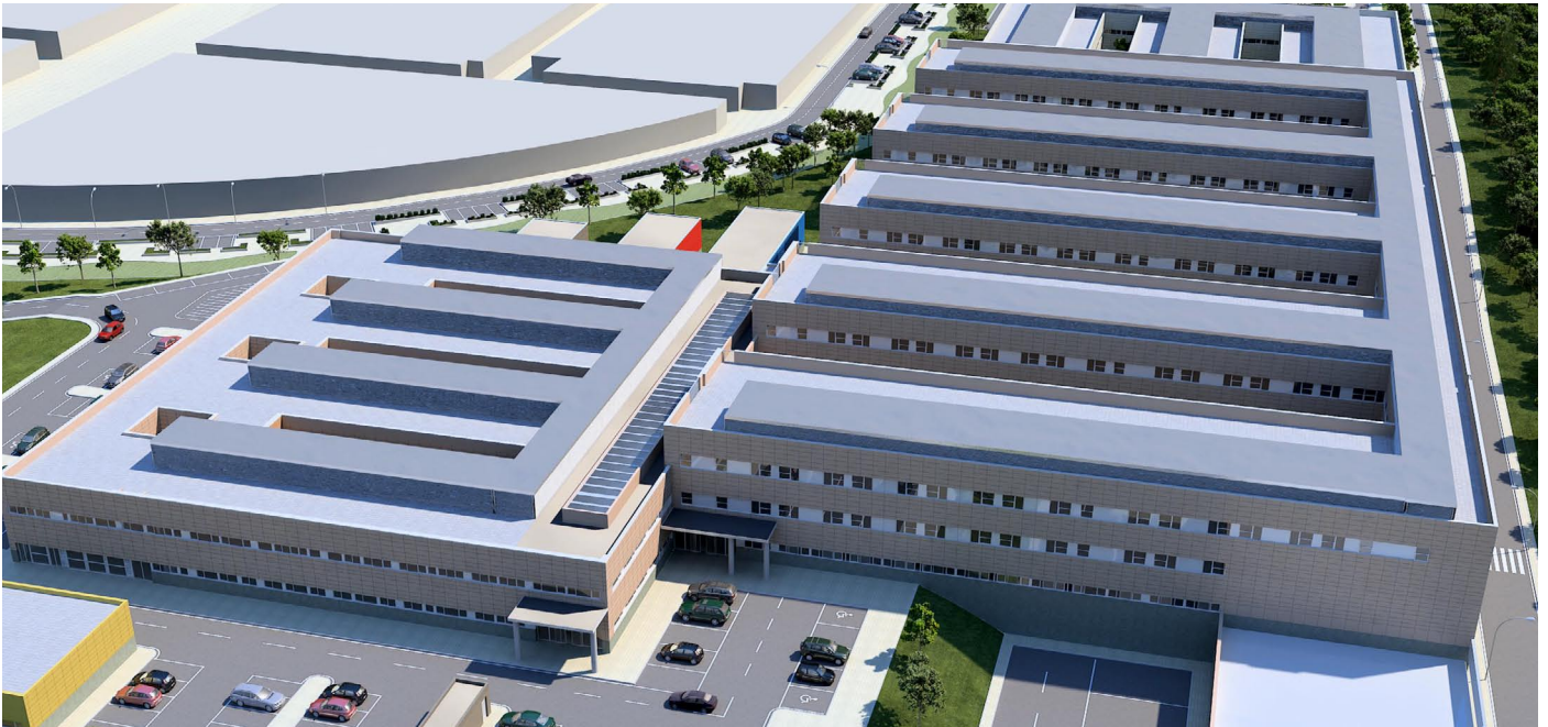
Infographics on Torrejón Hospital

The hospital will provide care for a population of 134,000