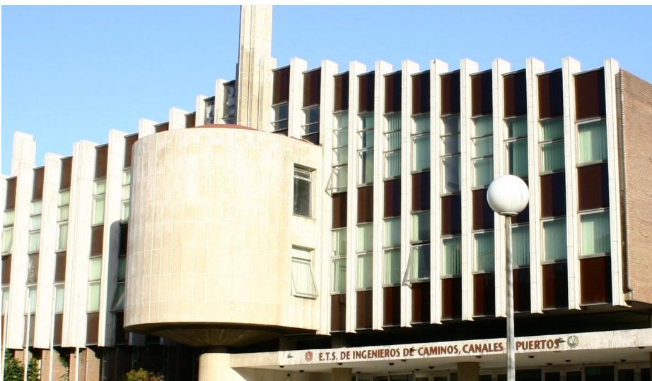
School of Civil Engineering in Santander

This project, which has had the support and cooperation of FCC Construcción since its start, helps offer university students two different ways of looking at things, beyond the mere theoretical plane: Students gain an overall view, acquainting themselves with the business sphere, and they get in touch with professionals who work in the sector, thus making it easier for the students to find a job in future.