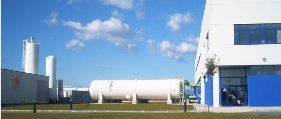
Seawater desalination plant

The facility has a budget of 16 million euro