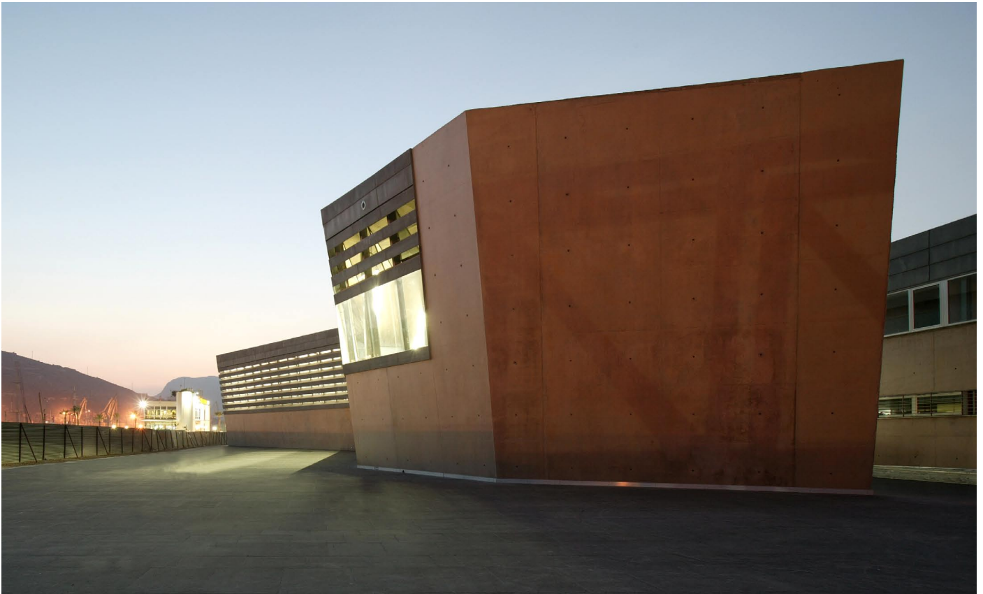
Close-up of the façades

Built by FCC and designed by architect Guillermo Vázquez Consuegra